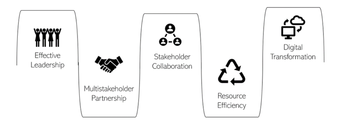
Figure 4: Building stakeholder nexus for smart sustainable cities for digital transformation

Engagement with key stakeholders and stakeholder groups is imperative. Effective leadership and engagement of key stakeholders is, therefore, necessary to ensure stakeholder buy-in, coherence in plans, as well as to avoid a duplication of efforts. In addition, the engagement of inhabitants at the grassroots level is equally important for resource allocation and efficiency. Strategic objectives for the SSC should be built upon participative consultation processes and substantial community support.